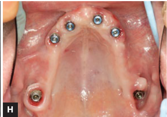
Figs. 1G & H